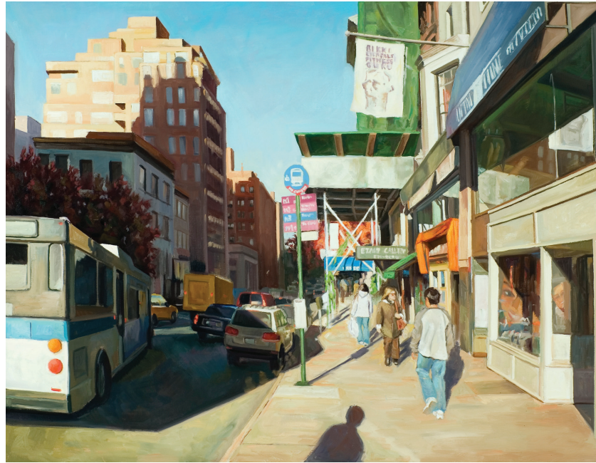
MIDTOWN, MIDDAY, OIL, 36 X 48.